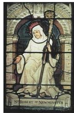
St Robert of Newminster A.D. 1159

Sunday 11 th Sept. 2011 24 th Sunday of the Year PLEASE PICK UP MISSALETTE FROM THE BACK OF CHURCH