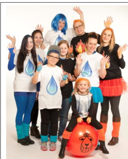
Group shot with a “hopper” at Leicester. T-shirts by Urgo

The Fire & Rescue Service supported the burn services and offered advice on fancy dress costumes, firework safety and house safety checks. Charities displayed information links on their websites and used social media to raise awareness.