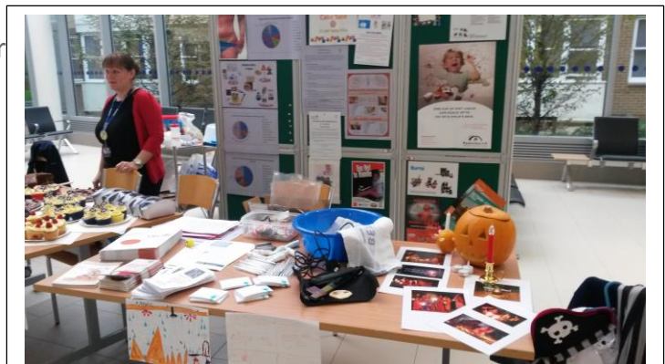
Burns Awareness Information Table at Broomfield Hospital

Hospitals, schools and play groups participated in the day and activities included surveys, cake sales, and park to park “hopping”. There was good coverage by social media and radio and TV played a prominent role with the burn services. A National Burn Awareness Card was released which highlighted the “Three C’s” Burn First Aid Message.